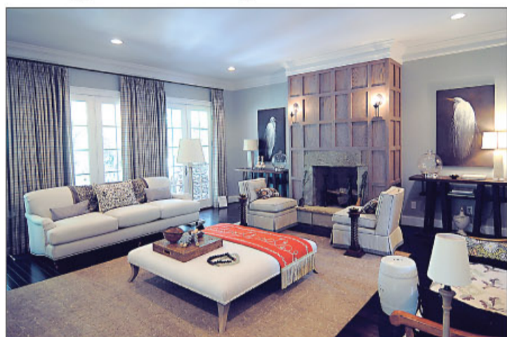
An open great room anchors the house's main floor.

Set on Mercer Mill Creek, the Idea House is located deep in Seawatch. Posted signs lead the way from the gate house. Turn-by-turn directions should soon be available online at www.seawatchideahouse.com .